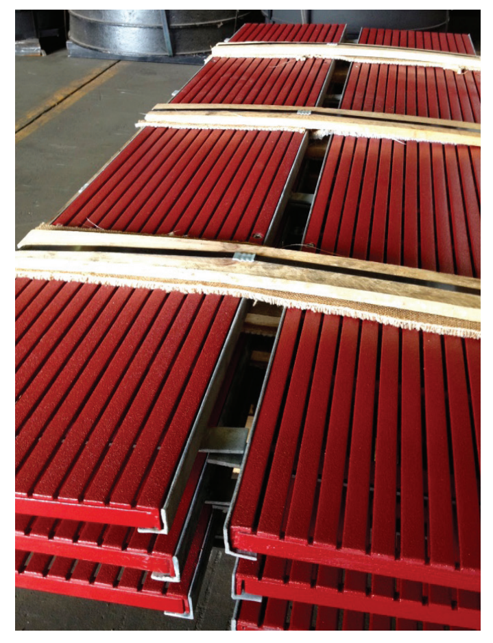
Photography: EJ HeelProof<sup>™</sup> Grates in your choice of colour

Those who design spaces where grates are used will appreciate the idea that they don't need to use boring grey product, unless they are deliberately specified to match surrounding bare concrete. With HEELPROOF™ grates, they can add a burst of sunny colours to their projects.